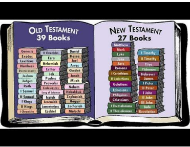
The Old and New Testament