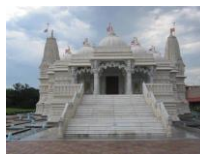
Mandir – Hindu temple