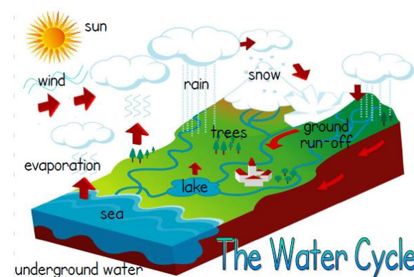
The Water Cycle