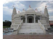
Mandir – Hindu temple